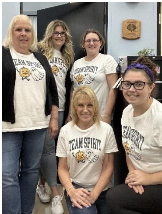
Your dedicated Credit Union staff!