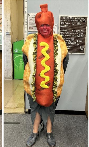
Our Credit Union Members!

Visit us at www.eriecountycrreditunion.net